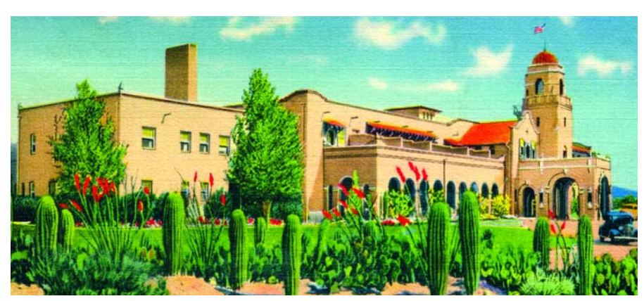
The El Conquistador Hotel.

Campbell Avenue Farm (1935, now The University of Arizona Campus Agricultural Center). Her work in Arizona towns outside of Tucson was equally prolific.